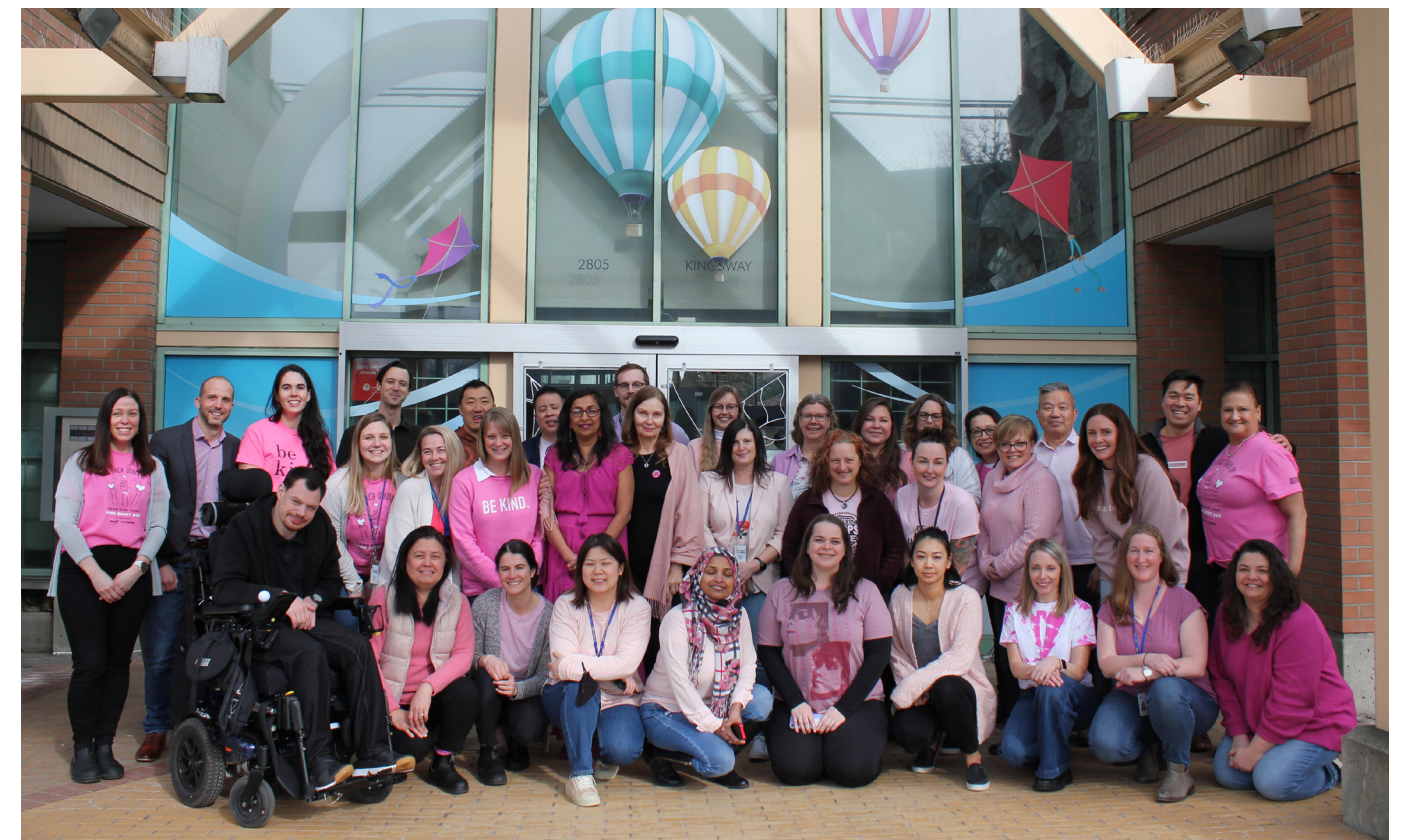
BCCFA staff on Pink Shirt Day, February 2023.

Family Centred: We honour and respect the unique needs and preferences of our clients, celebrate our diversity and ensure that clients, families and caregivers are at the centre of everything we do.