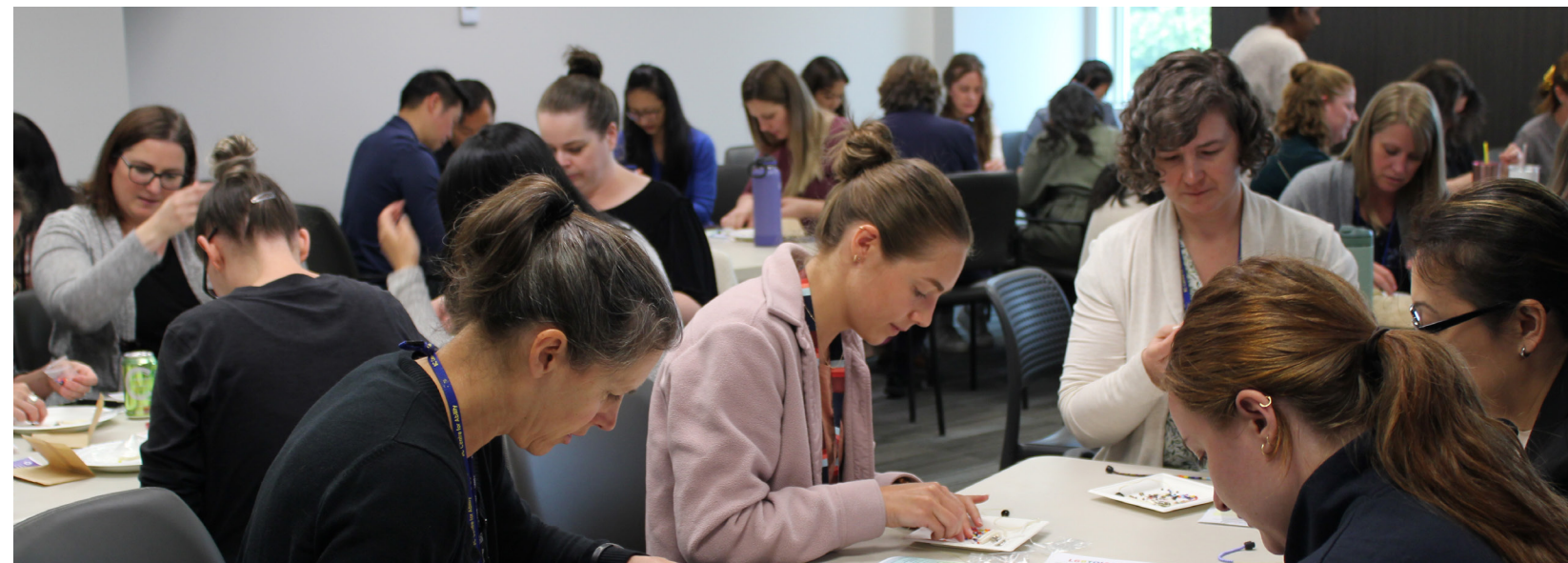
Lanyard beading event hosted by BCCFA's Diversity and Inclusion Committee in June 2023, in honour of Pride and Indigenous History Month.