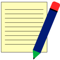
Pen and paper

AAC includes all the ways we communicate without talking. We all use AAC every day!