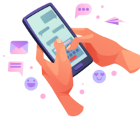
Letters, keyboards & emojis